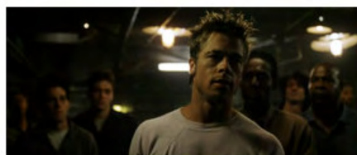
“Working jobs we hate...” Photo: Brad Pitt in Fight Club

What we have to offer is freedom and solidarity. No, solidary individualism is not a contradiction, we are convinced that there can be a society “where the free development of each is the condition for the free development of all” ( Karl Marx, 1848 ). And that is why we still call a war a war and still consider poverty and marginalisation a scandal; that is why we are by conviction emancipatory and on the left , which is the same for us.