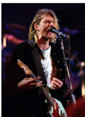
“Generation X” Photo: Curt Kobain, Nirvana

We are no longer the Generation X that calls out to the party and business leaders: „Here we are now, entertain us“ ( Nirvana ). We’ve seen the Ärzte and are still in favour of visions.* But the eternally unredeemed promise of full employment is no longer on offer.