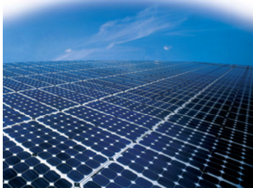
“100 percent renewable energy”

We don’t believe that talent is inborn, because every person has potentials. What we want, therefore, is a revolution of our education system . No more learning factories and fees, no more selection according to background, no more fast-track studies and fast-track Abitur! Let’s invest our wealth in the potentials of the people, in their education and development, in what we have in common and our culture, no longer in luxury mansions and luxury trips, no longer in luxury cars, no longer in all the private ersatz trappings.