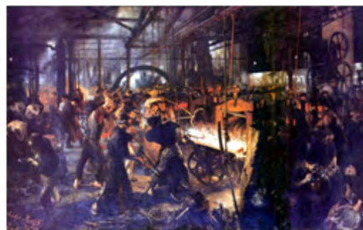
“Rules and rhythms of industrial society”

– for both genders – the possibility of free choice . We no longer believe that the rules and rhythms of the family, the old school, the barracks and the factory are the models for our life, love and work, we step out into the open field and out of industrial society. No one should have to earn a life of human dignity in the market place, a new social foundation therefore requires a new guarantee .