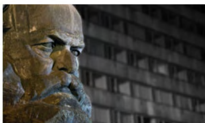
“The free development of each, the free development of all”